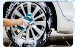
RIMS & TIRES